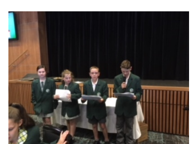
Leadership By The River

Tuesday 1 May School commences 10.30am ANZAC Service